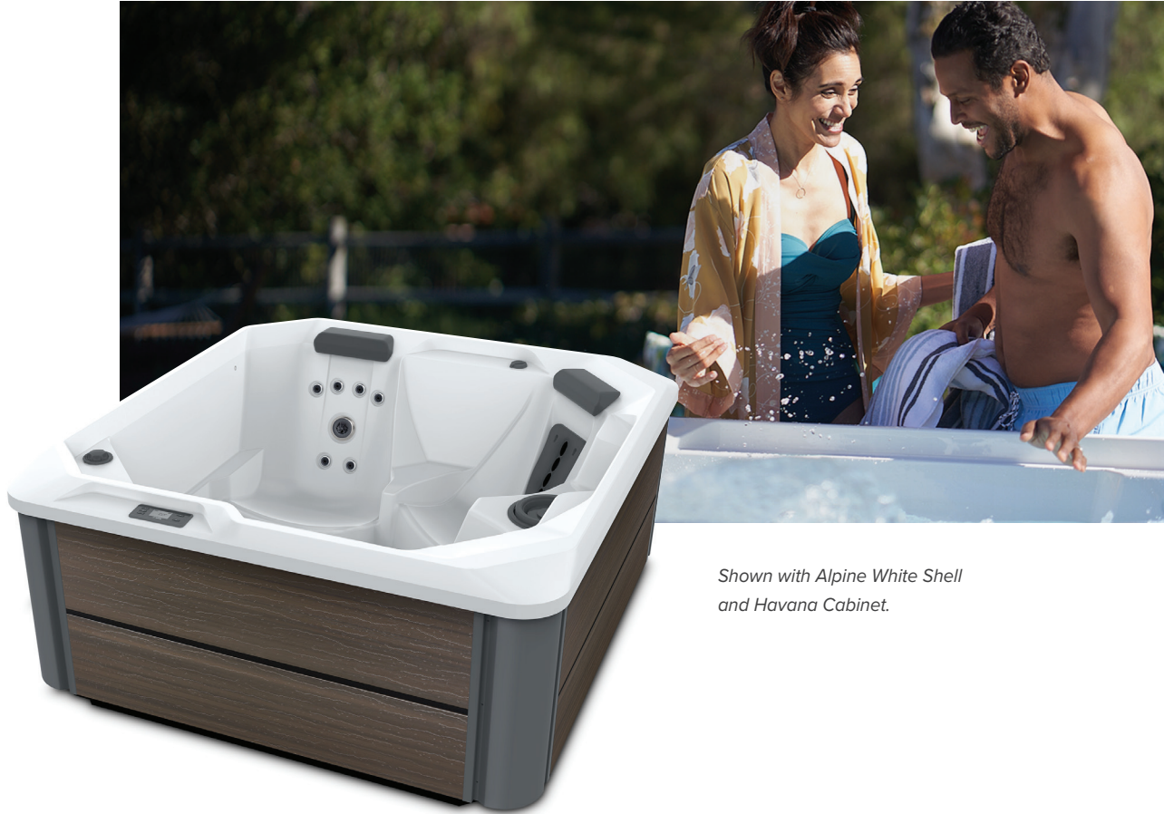
Shown with Alpine White Shell and Havana Cabinet.

People Seating Jets Voltage 3 Seats Open 18 Jets 115 V or 230 V